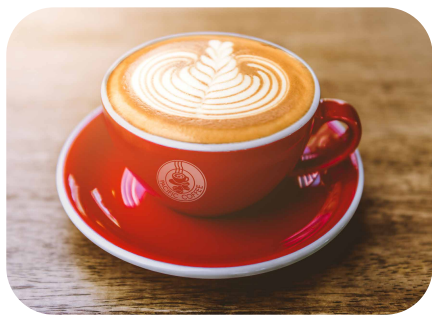
An extra cup of handcrafted beverage of the same or lower value

Use $1 CASH dollar to redeem an extra cup of handcrafted beverage or below designated food by purchasing any tall size or above handcrafted beverage at Pacific Coffee