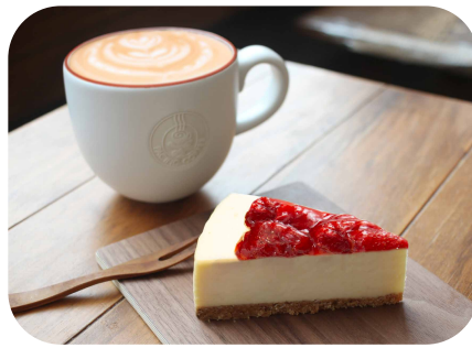
Strawberry Cheese Cake