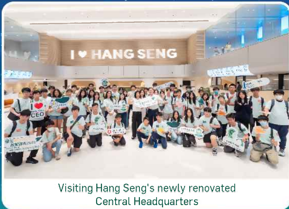
Visiting Hang Seng's newly renovated Central Headquarters