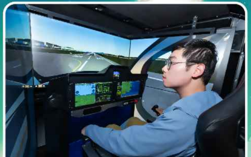
Experiencing the life of an astronaut