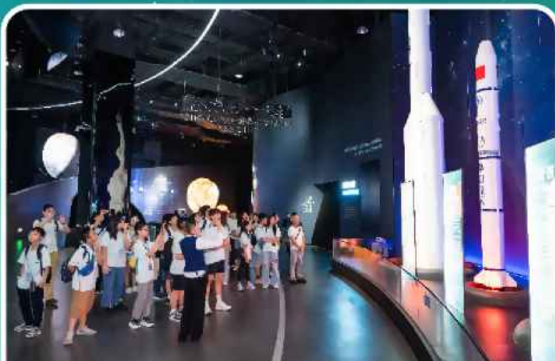
Travelling to the Zhuhai Space Center