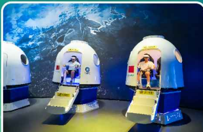
Stepping into a full-scale replica of the Tiangong Space Station